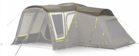
Pro II V2 Roof Cover