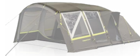
Pro TXL V2 Roof Cover