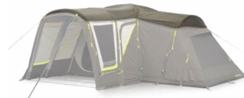
Pro III V2 Roof Cover