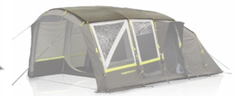
Pro TL V2 Roof Cover